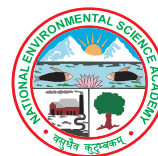
National Environmental Science Academy (NESA) New Delhi